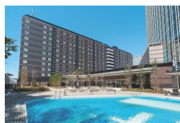
Tokyo Bay APA Resort ★★★★★