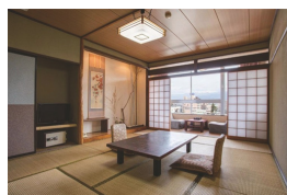
Heian Hot Spring Hotel ★★★★★