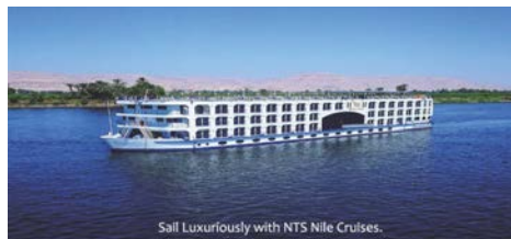
Sail Luxuriously with NTS Nile Cruises.