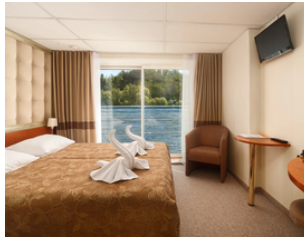
Deluxe Cabin with French Balcony