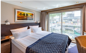
Deluxe Cabin with French Balcony