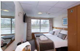
Deluxe Cabin with Sliding windows