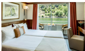
Deluxe Cabins with Balcony