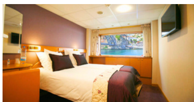
Standard Cabins with Large Windows