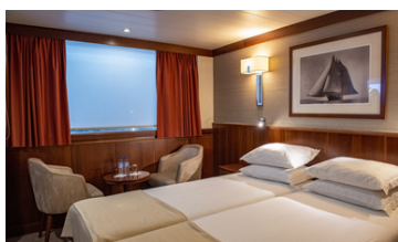
Standard Cabins with Large Windows