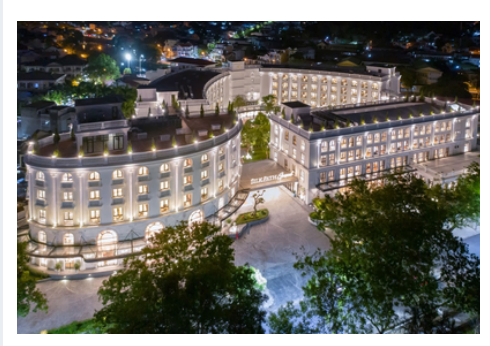
Silk Path Grand Hue Hotel