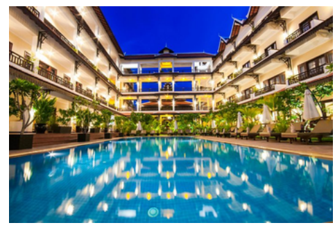
Saem Siem Reap Hotel