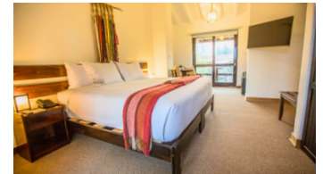
Tierra Viva Valle Sacred Valley or equivalent