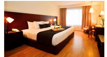
Dazzler by Wyndham Lima Miraflores or equivalent