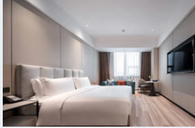
Golden Pear Hotel Wuxi