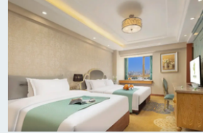
Chengdu Qingtong City Hotel