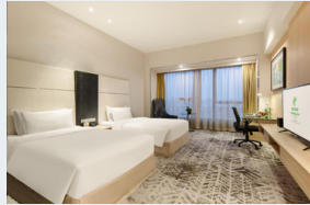
Holiday Inn Shanghai West