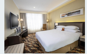
Metropark Hotel Kowloon