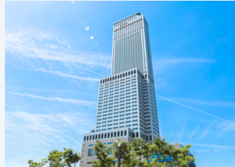
Odysis Suite Osaka Airport Hotel or equivalent