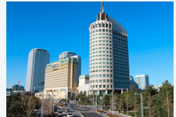
Hotel The Manhattan Tokyo or equivalent

Upgrade to Superior Room in Osaka & Tokyo: USD $149/person